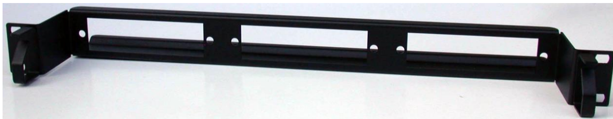
1U deepened bracket for three 1H LGX boxes with cable relieves and backrest