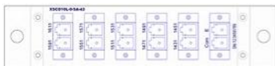
Figure 1 XM10-AC43LL - Single fiber Single side 10 wavelengths DWDM OADM version A