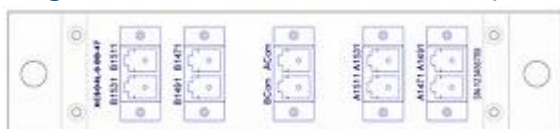
Figure 3 XM04-?C47LL - Single fiber Dual side 4 wavelengths DWDM OADM (1471 to 1531nm)