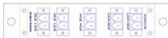
Figure 4 XM04-?C55LL - Single fiber Dual side 4 wavelengths DWDM OADM (1551 to 1611nm)