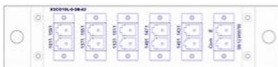
Figure 2 XM10-BC43LL - Single fiber Single side 10 wavelengths DWDM OADM version B