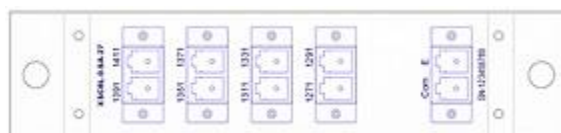
Figure 3 XM08-AC27LL - Single fiber Single side 8 wavelengths CWDM OADM version A