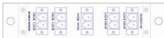
Figure 6 XM04-?C55LL - Single fiber Dual side 4 wavelengths CWDM OADM (1551 to 1611nm)