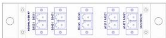
Figure 5 XM04-?C47LL - Single fiber Dual side 4 wavelengths CWDM OADM (1471 to 1531nm)