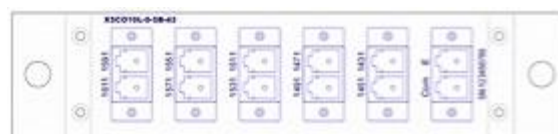
Figure 2 XM10-BC43LL - Single fiber Single side 10 wavelengths CWDM OADM version B