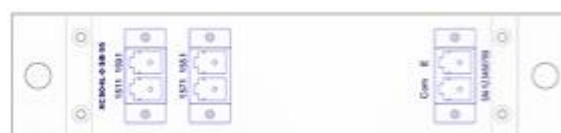
Figure 4 XM04-BC55LL - Single fiber Single side 4 wavelengths CWDM OADM version B