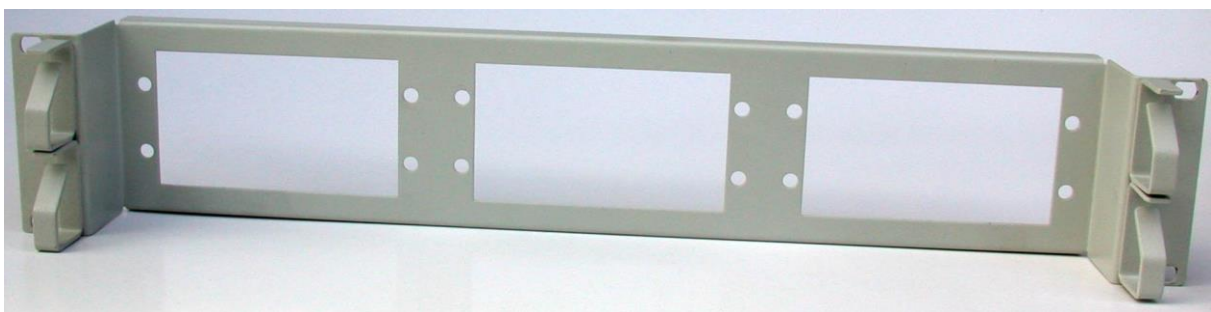
2U deepened bracket for three 2H LGX boxes with cable relieves