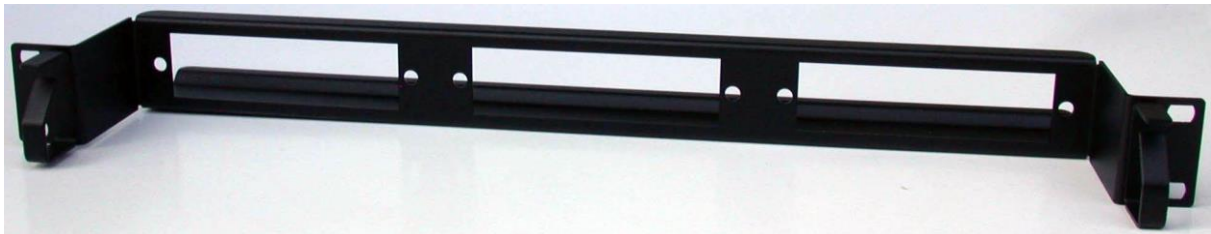
1U deepened bracket for three LGX boxes with cable relieves and backrest