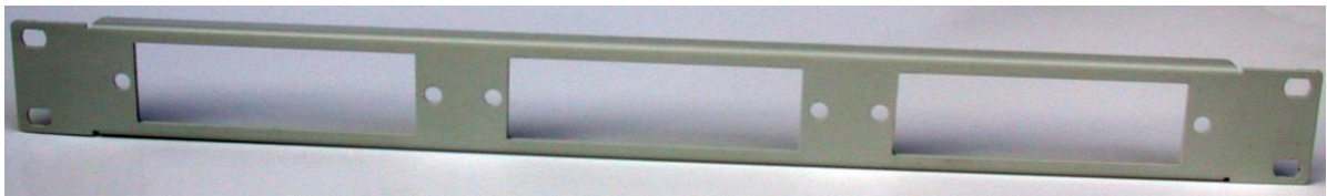
1U flat bracket for three LGX boxes