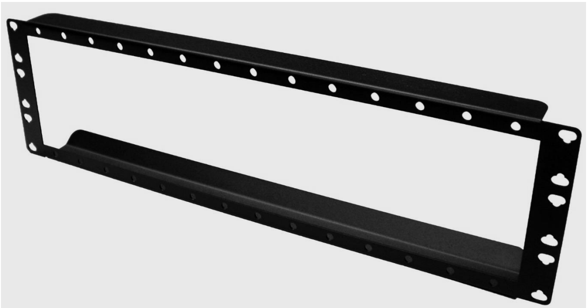
3U flat bracket for 14 LGX boxes