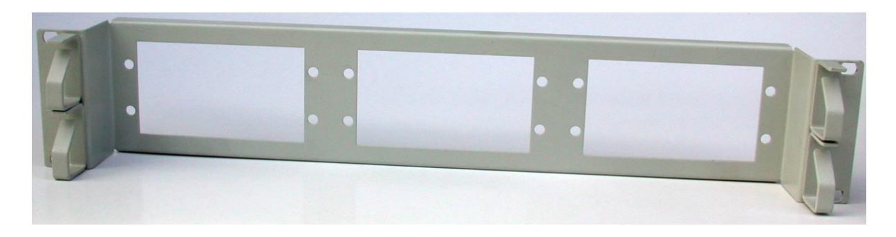
2U deepened bracket for three 2H LGX boxes with cable relieves