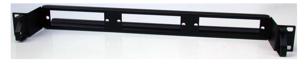
1U deepened bracket for three LGX boxes with cable relieves and backrest