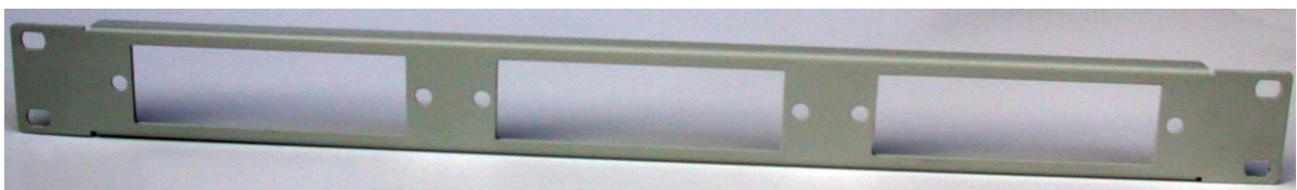
1U flat bracket for three LGX boxes