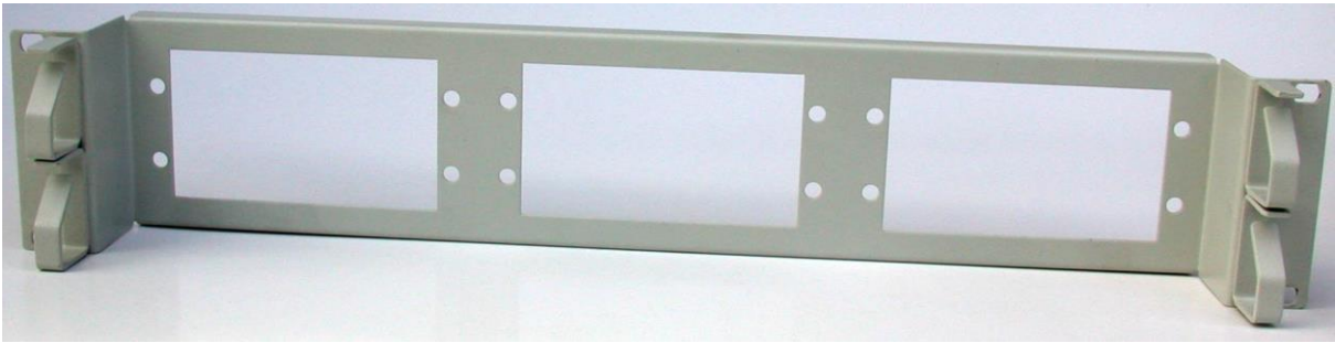
2U deepened bracket for three 2H LGX boxes with cable relieves