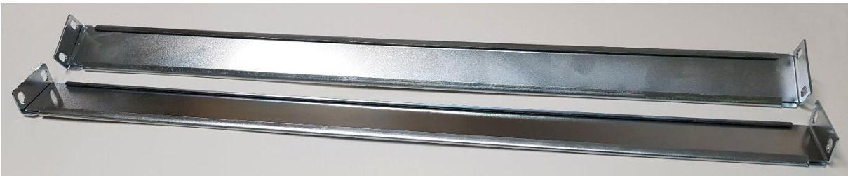
Universal rails for mounting devices in 19" rack