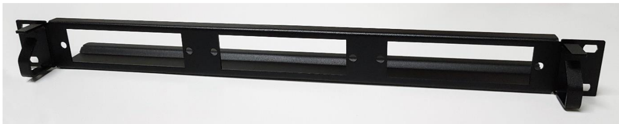
1U flat bracket for three LGX boxes with cable relieves and backrest